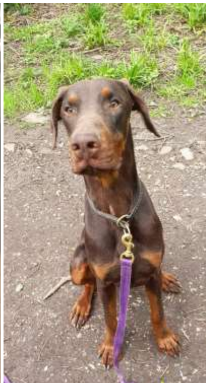
Look at me sitting pretty