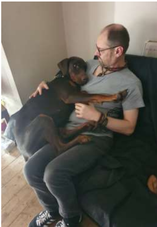
Baby boy Rio