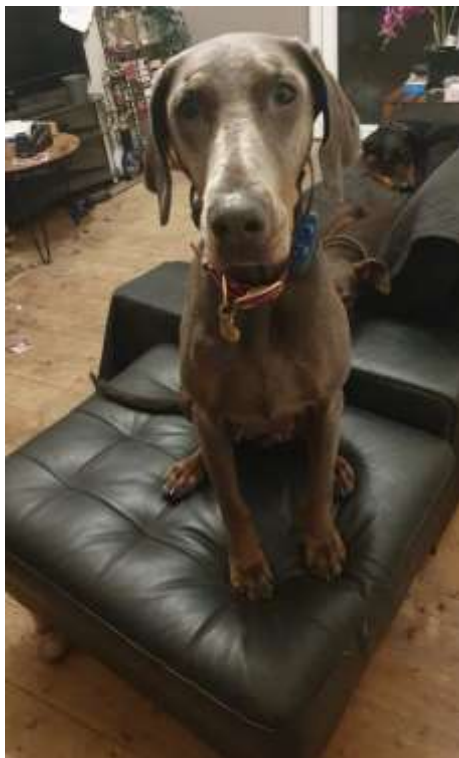
Isa (one of Rio's new ladies)