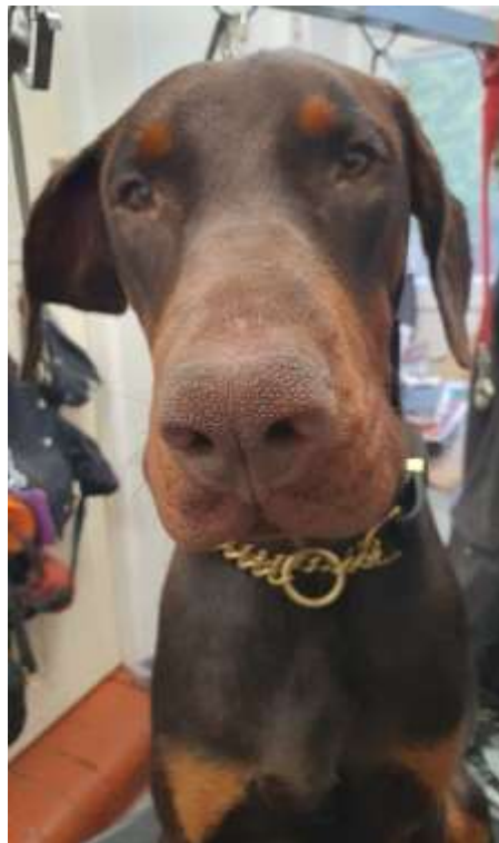
I am ready for my close up