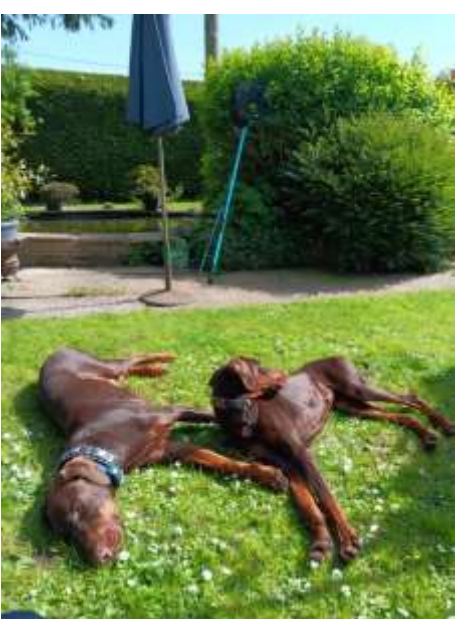
Out for a walk with Di (Vinnie) Time for some sunbathing